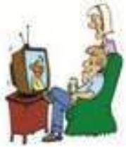
j) I watch TV