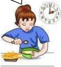
e) I have lunch