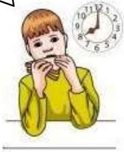
b) I have breakfast