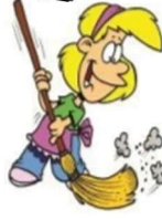
g) I clean the house