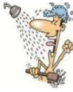
k) I have a shower