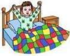
a) I wake up