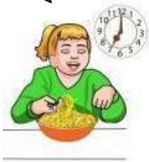
i) I have dinner