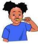
c) I brush my teeth