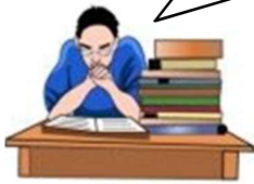
f) I study and I do my homework at home