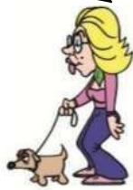
h) I walk the dog